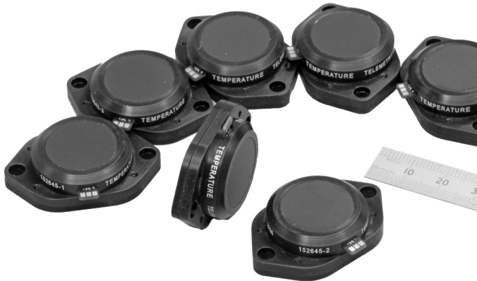
Figure 1: 1 channel transmitter

Transmission Dynamics have developed a novel, wireless Temperature Telemetry Transmitter which measures 42 x 27 x 11 mm. The transmitter is fully autonomous and contains Bluetooth wireless technology, an integrated battery and microprocessor. To use the system, simply solder the temperature probes or configured resistive based sensor, and turn on the receiver unit.