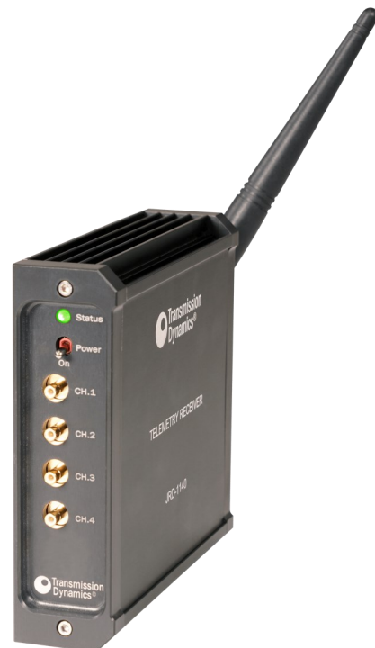
Figure 2: 4-channel receiver

When using with the remote transceiver, if the temperature of any of the transmitters increases beyond the user definable limit, an automated SMS and/or email notification is dispatched within minutes - allowing swift action to be taken. This allows the Temperature Telemetry Transmitter to be ideal for condition monitoring of industrial systems.