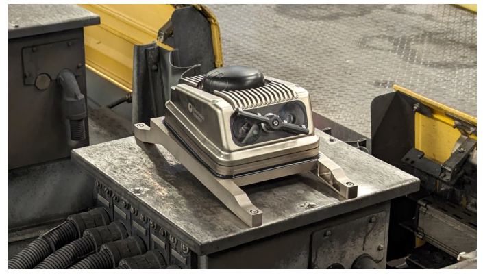
PANDAS-V® camera installed on a train roof