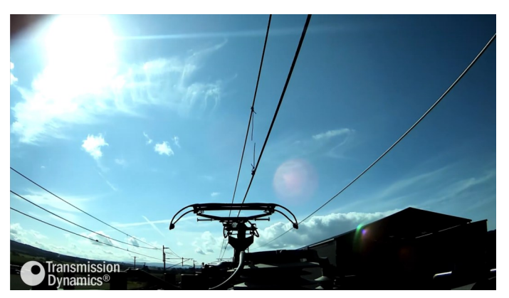
Broken Dropper Wire